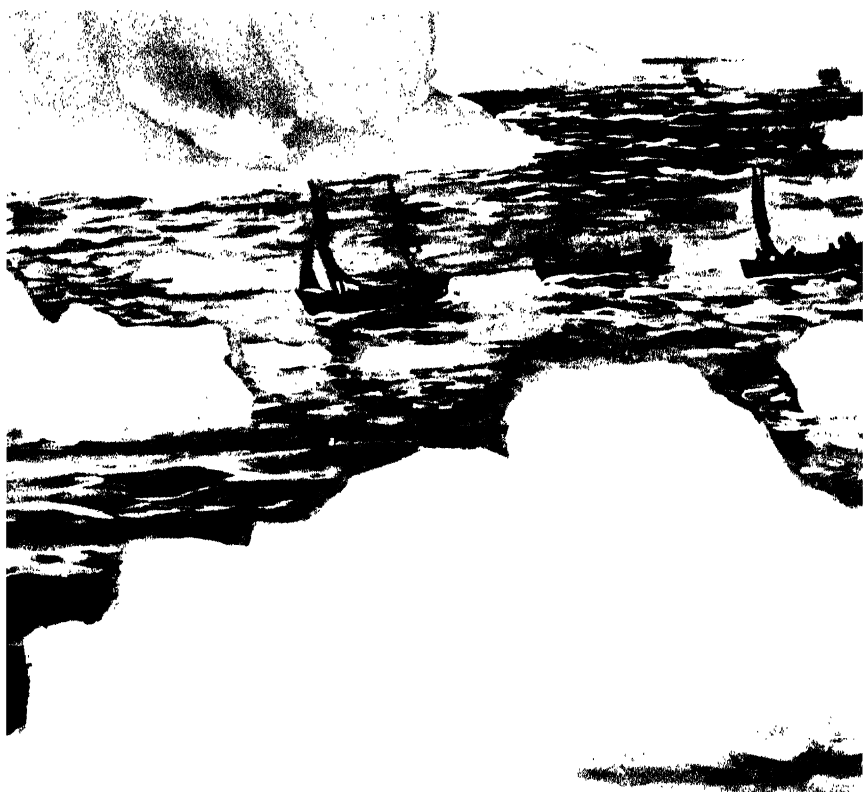
The three boats attempting to reach land. Another drawing by George Marston.