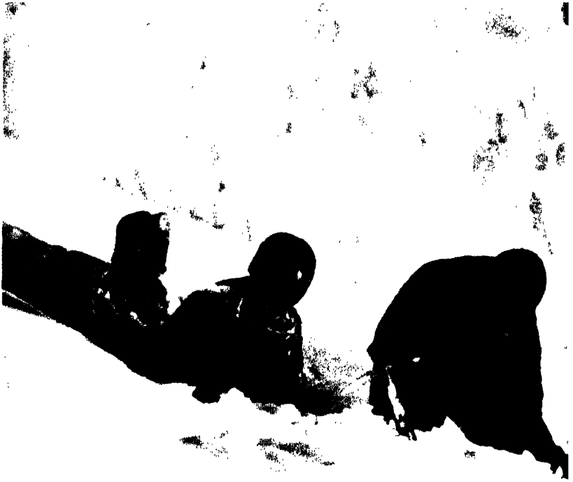
Below: Loading the Caird .