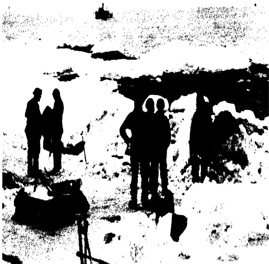
1 P.M., August 30, 1916.