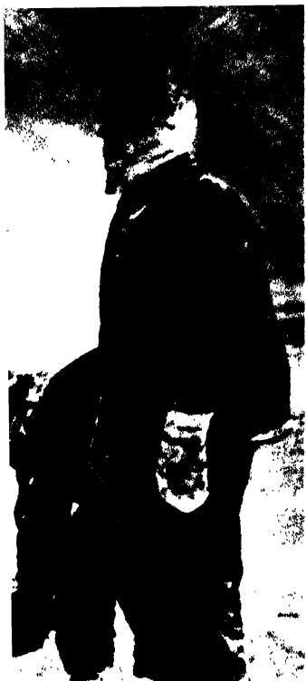
Left: Attempting to dig a sheltering cave on Elephant Island.