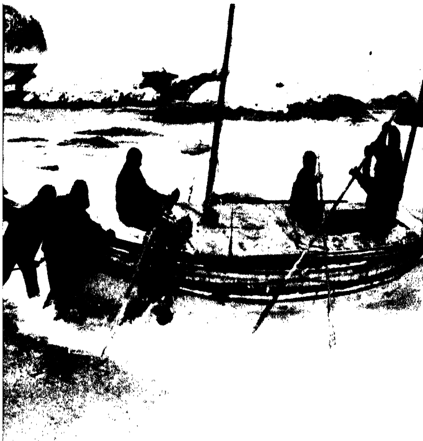
Launching the James Caird , April 24, 1916.