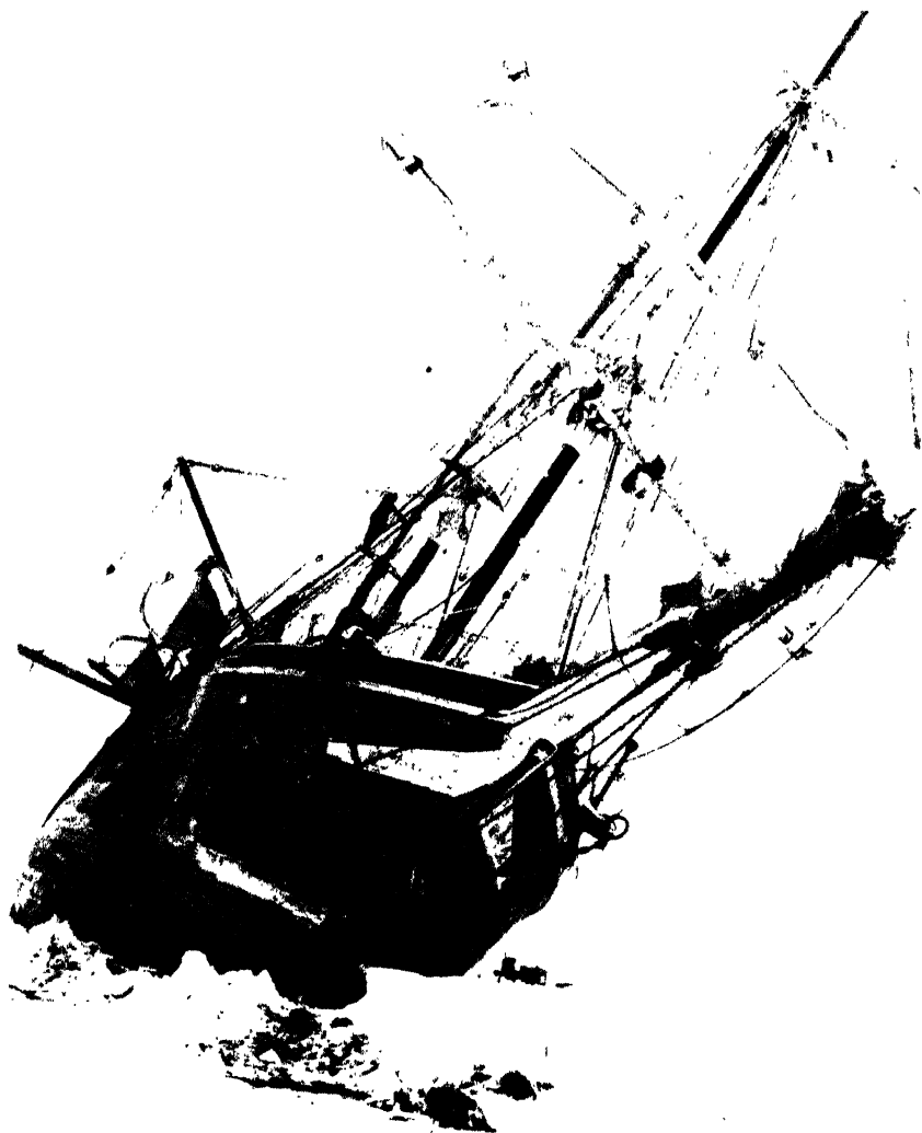
The Endurance heeled to port under pressure.