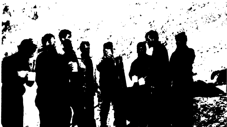
Below: The first hot drink in days, minutes after the landing on Elephant Island.