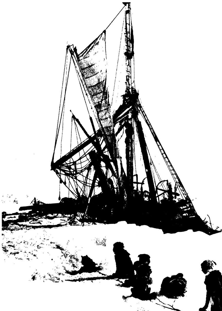
A team of dogs disconsolately looks at the tangle of rigging still above the surface of the ice.