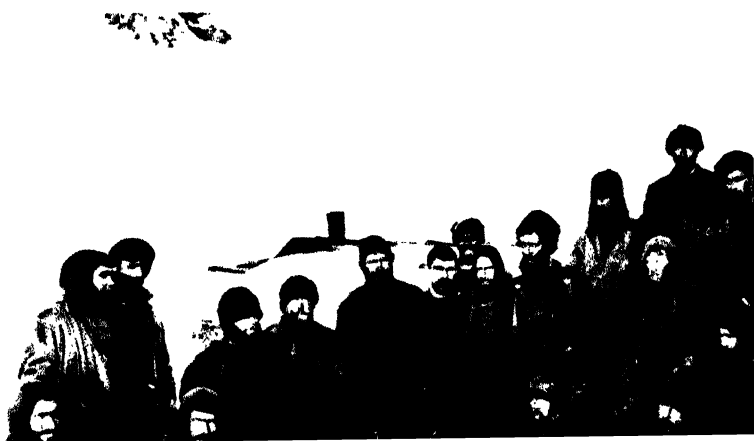
Marooned. Frank Wild (front row, second from the left) and most of the men left behind on Elephant Island.