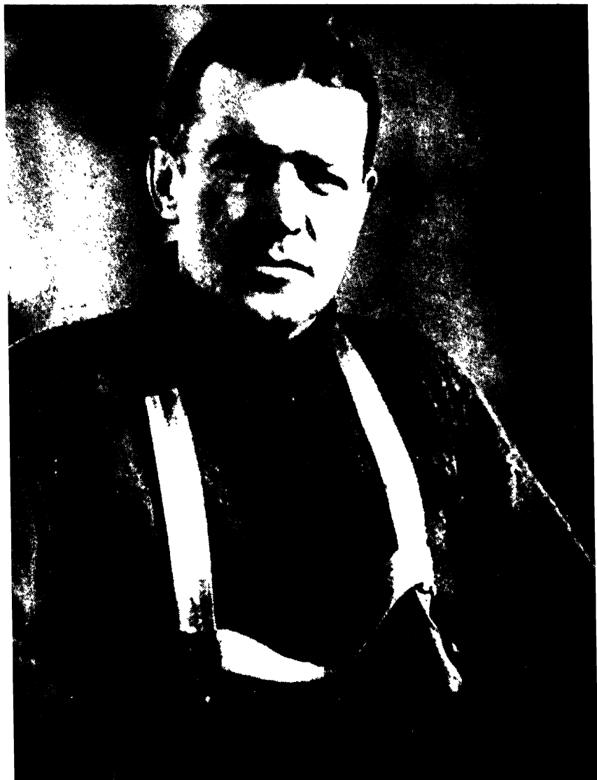
Sir Ernest Shackleton, 1915.